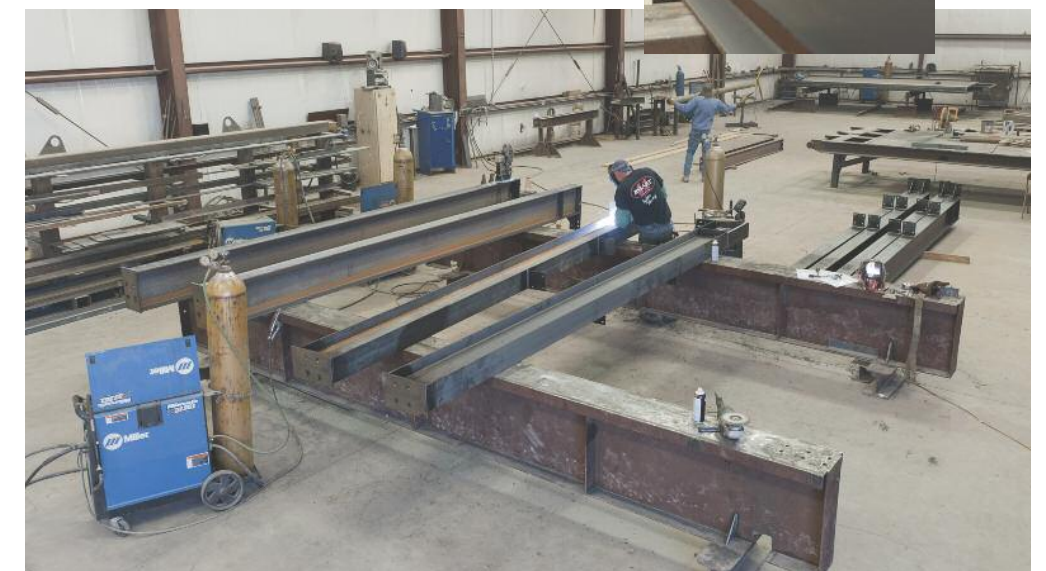
Our spacious 13,000 sq. ft. workshop allows us to fabricate framework that expedites erection on your site in record time.