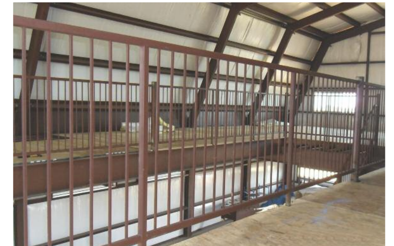
Beautiful and safe custom railings complement the design of your building.