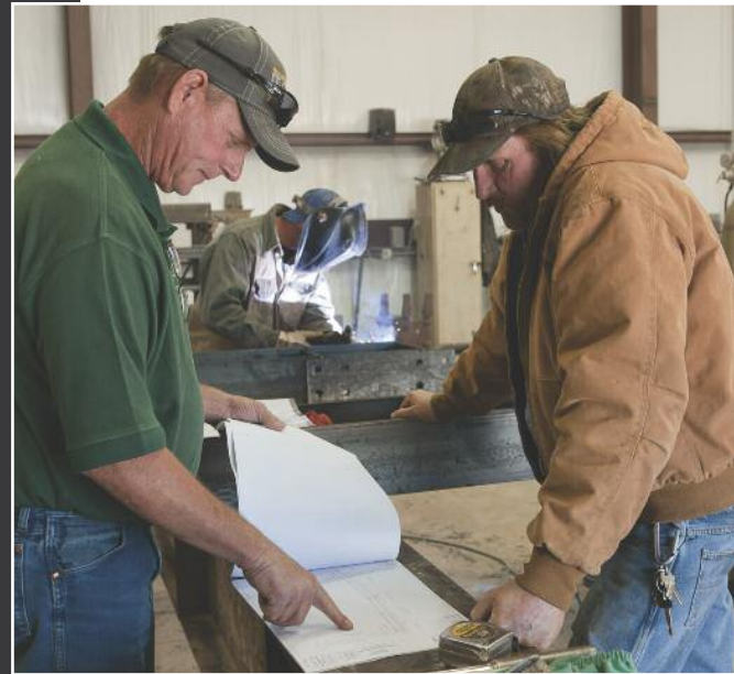
Our drafting detailing and engineering expertise produces a building that fits your needs and includes your custom features.

References will gladly be provided upon request