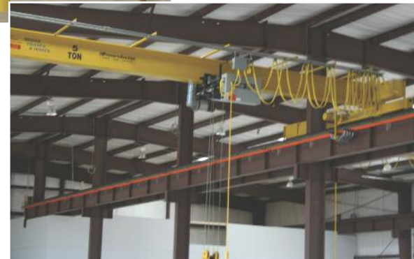
Young's Building Systems has all the equipment and knowledge needed to tackle any variety of projects.